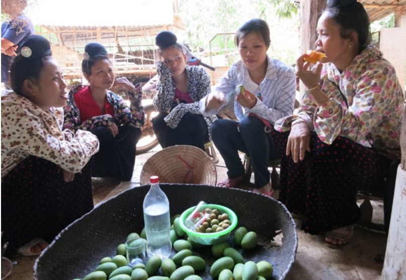
Thai ethnic women eating fruit in Son La, Viet Nam