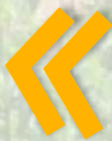
4. Quantify seedlings used