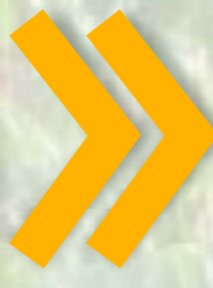
2. Identify and select interested farmers groups