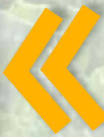
5. Land preparation