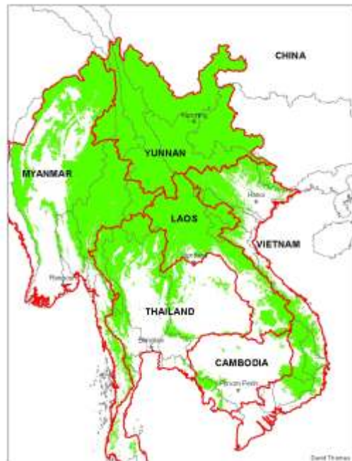
Figure 2: The Montane Mainland Southeast Asian (MMSEA) eco-region is comprised of those areas between 300 to 3000 masl, lying within the basins of the Yangtze, Salween, Irrawaddy, Mekong, Black, Red, and Pearl Rivers. This region covers approximately half of the land area of Cambodia, Laos, Myanmar, Thailand, Vietnam, and Yunnan Province of China.

The Montane Mainland Southeast Asia (MMSEA) eco-region covers areas between 300 to 3000 masl lying within the basins of the Yangtze, Salween, Irrawaddy, Mekong, Black, Red, and Pearl Rivers. This region constitutes approximately half of the land area of Cambodia, Laos, Myanmar, Thailand, Vietnam, and the Yunnan Province of China (figure 2). Nation states have a strong interest in the political and environmental security of the 'roof' of Southwest China and Mainland Southeast Asia. During the past two decades, the Yangtze, Red, Mekong, Tonle Sap, and Chao Phaya rivers have flooded frequently, causing some of the worst devastation in recorded history. In addition, development of massive tourism hubs and establishment of infrastructure for communication and transportation along the Mekong and other river systems have great impacts on land use, livelihoods, and ecosystem services. These developments, to a certain extent, encourage mountain communities to take advantage of mountain ecologies to produce and process specialized or 'niche' products for sale in lowland markets, as well as to develop joint management plans, eco-tourism and/or on-farm tourism, and benefit-sharing schemes for good land-use practices, biodiversity, and watershed conservation. At the same time, some mountain communities have been drawing on their traditional,