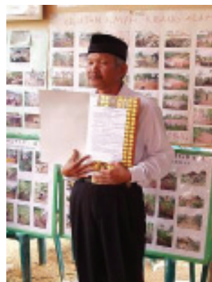
Farmer group leader receives his Community Forestry permit.

On the technical side, ICRAF analyses on river flows and land use cover change kept the technical experts and powerful interest groups from disregarding farmers’