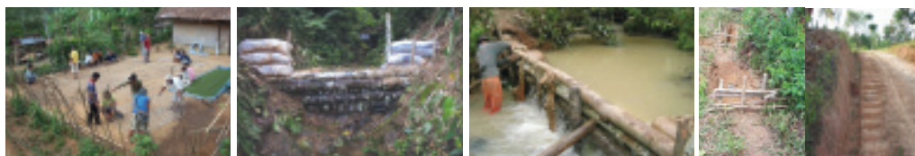
Community action: reduce runoff speed and trap sediment on path road

The second RUPES project also involves watershed functions. In Sumberjaya, the National Electricity Company (PLN), owner of a hydropower dam (PLTA), is worried about the often high sediment load and supposedly high siltation of the reservoir. The solution for the hydropower electricity company is to keep sediment from reaching the reservoir in the first place. To this end, a community partnership scheme is under development with PLN through a payment for environmental services (PES) mechanism. In response to this, RUPES set up a pilot project within one community