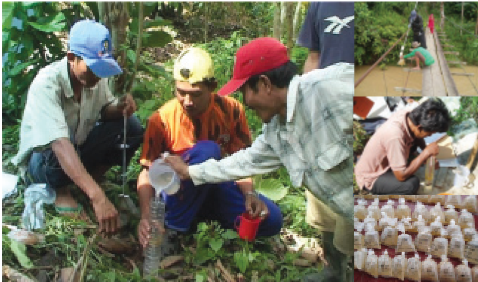
Community Water Monitoring

In the pilot project, baseline data were collected in order to quantify current sediment levels before project activities. A sediment rating curve was developed, relating sediment load with discharge. Sampling was also done at various sites along the river to identify the largest sediment contributing areas and erosion hot spots. ii Here, river water samples are taken using a depth integrated method and dried, after which the sediment is weighed in a field lab. Direct readings of visual clarity are made with self-constructed “transparency tubes”, based on the so-called Secchi disc principle. This visual clarity (or Secchi disc visibility), is converted to sediment concentration after calibration with the field lab results. With these methods, the community can monitor the sediment by themselves with assistance from researchers.