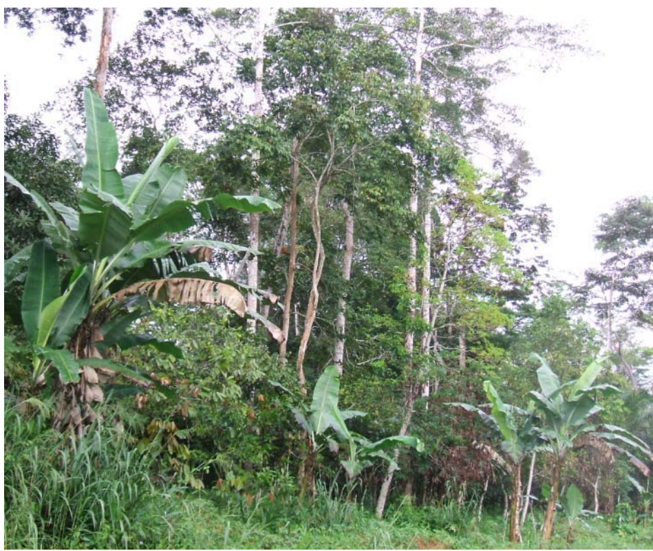
Figure 5: Multistrata cacao (Theobroma cacao L.) agroforestry systems in Cameroon Discussion and Conclusions al., 2000). Very weak extension syst

From the foregoing it can be seen that agrarian transformations in both Southeast Asia and Africa have been different both in terms of nature and speed. There has been rapid adoption of more profitable and valuable tree-based systems in Asia (e.g., rubber, oil palm, orchards, and teak (Tectona grandis L.) plantations) as opposed to expansion in traditional cacao systems and management of trees in the parklands of Africa. These land use transitions have been largely influenced and weaved into the broader economic trends and dynamics of each region. It can be said that better market access and connections to processing and industry in growing urban areas, dynamics in labour migration (rural –urban), and investment flows through remittances from urban areas have characterized the transformations that have occurred in (Cramb et al., 2009; van Southeast Asia Noordwijk et al., 2008). The slower pace of agrarian transformation in Africa has in several instances matched the boom-and-bust cycles of economic development (Sunderlin et