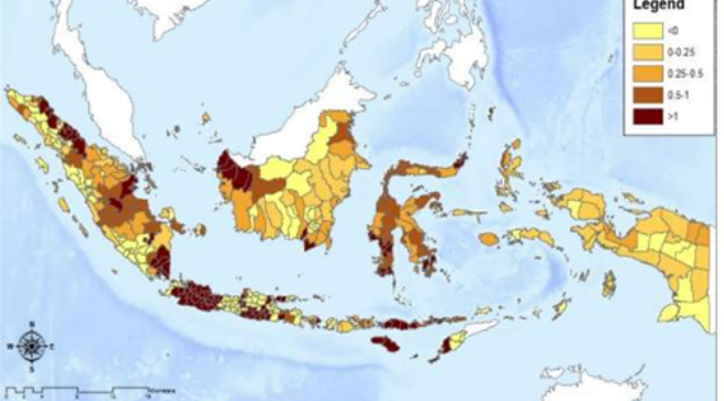
A: In the 1990's loss of natural cover increased the amount of 'low Cstock'/low economic value land; tree (crop) planting was 28% of the loss of natural forest area

clearly changed between the two time periods, with the latter period showing more evidence of HCSRD. INCREASE OF MONOCULTURE TREE COVER VS LOSS INCREASE OF MONOCULTURE TREE COVER VS LOSS OF CLOSED CANOPY-FOREST 1990-2000 Legend