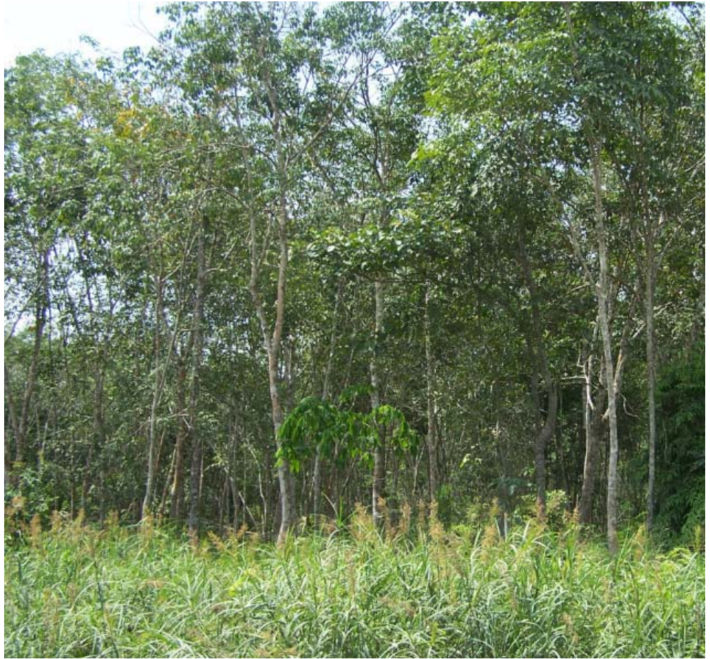
<u>Figure 3</u> Jungle rubber (Hevea brasiliensis) in Jambi, Indonesia. Currently being replaced by more commercial rubber and oil palm.

60,000 additional ha were regenerated by villagers through mutual agreement in a land use planning process in which communities were given mandate to control access, use