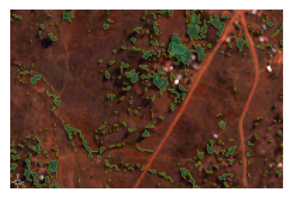
Fig. 6.2 Delineation of TOF crowns by remote sensing using sub-meter resolution Quickbird imagery (Gumbricht unpublished)

resolution, it is not possible to identify trees and may lead to underestimation of biomass. Unfortunately, the price of the satellite imagery increases in parallel with the resolution and the specialized skills necessary to process the imagery limits many applications of this technique outside of the research arena at this time. Despite the challenges, crown area allometry is likely the most promising approach to transform our ability to capture information on aboveground biomass stocks, potentially for relatively low total costs in the future (Gibbs et al. 2007; Wulder et al. 2008).