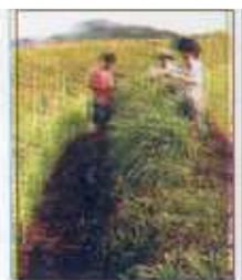
Landcare promotes simple technical innovations that control soil erosion and require less labor.