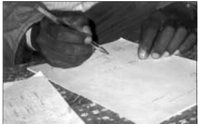
Timber broker drawing a marketing chain, Kenya

Many farmers in developing countries show an interest in managing trees to produce quality timber for specific markets. Experience indicates that farmer