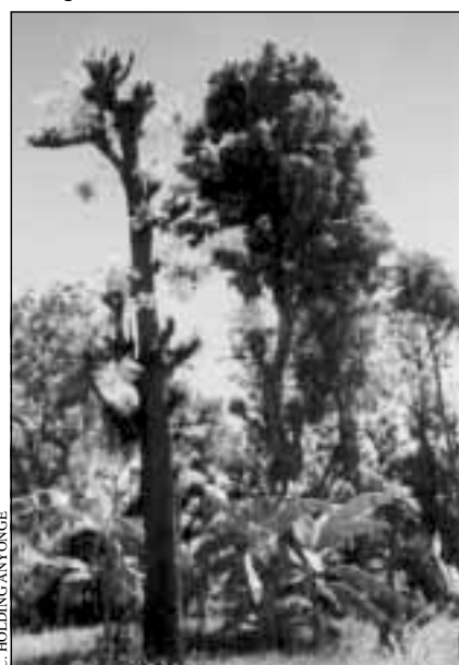
C. HOLDING ANYONGE

Confused tree management: a result of conflicting advice from extension staff in forestry and agriculture