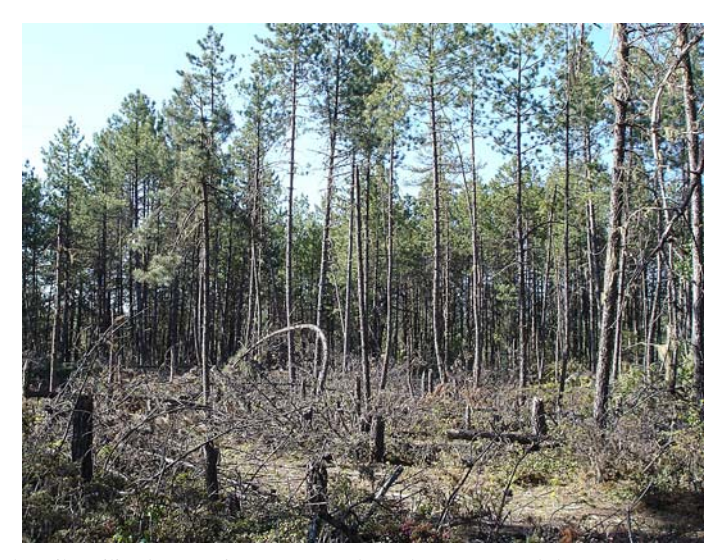
Fig. 3 The heavily utilized Pinus densata forest shows large gaps and the removal of over half basal areas and canopy covers

Estimates of timber needs and rate of tree removal