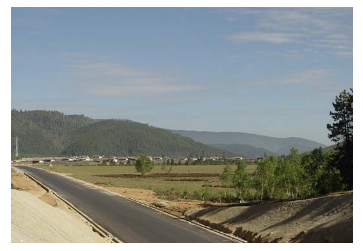
Fig. 2 Looking north to upper Jisha along the new highway, which was cut through the cemetery forest. This road has granted easy access to large areas of pine forest to the south

There have been very significant socio-economic changes to these communities in recent years—the most dominant of these has been the proscription of commercial logging. The absence of commercial logging has placed greater pressure on villagers to find alternate incomes, resulting in a rise in NTFP collection, attempts to increase livestock, off-farm work, and the collection of wood and timber from community forests, which is often (unofficially) used to supply township firewood and construction needs. In addition, these rising demands on village forests are accompanied by the construction of a new road; Jisha now has a large highway running through it (National Highway No. 214), effectively bisecting Upper and Lower Jisha, and driving straight through the cemetery forest south of the village (Fig. 2). This