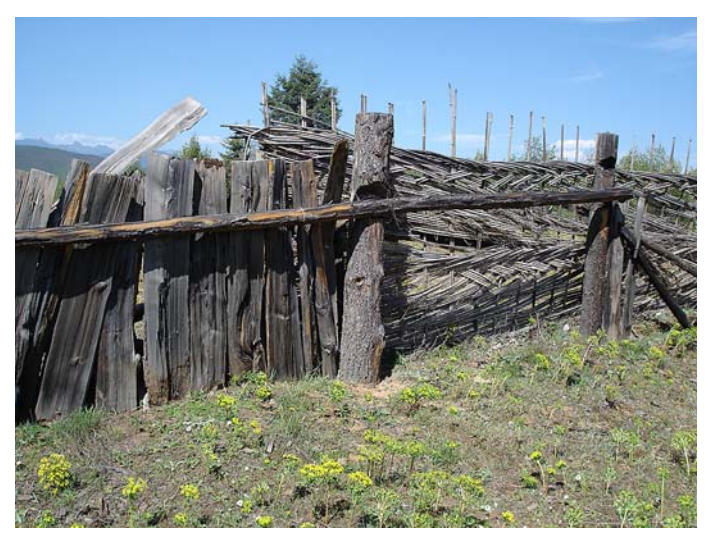
Fig. 4 Traditional bamboo fencing is being replaced by less durable pine fences—this requires up to 35 times more wood