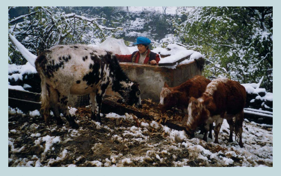
FIGURE 3 A woman observing whether her cattle like to eat silaged cornstalks.

"People without silage fodder, their cattle died in the heavy snowfall. Even though I have the biggest number of cows in the hamlet, they all survived the snow. Everyone can see the benefits now." (A farmer who experimented with silage fodder)