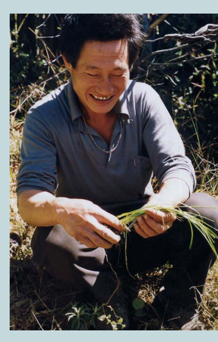
FIGURE 1 A farmer using his local knowledge in evaluating the characteristics of the exotic black rye grass ( Lolium perenne ) in comparison to local fodder sources and in experimenting with different planting methods.

Members of agropastoralist communities often have rich indigenous knowledge relating to animal husbandry. Surveys have found that experienced herders are able to list and elaborate on the properties of more than 50 species of fodder grass (Figure 1). A range of indigenous practices can be found that enhance animal productivity, such as feeding chicken or goat meat to cows after they have given birth, thus increasing milk yields and promoting ovulation. Traditional social arrangements between relatives and neighbors are a common way of mobilizing labor for herding. Given that the availability of natural fodder resources varies greatly over space and time, most transhumant communities have their own-traditional or more recent-arrangements for managing the use of grasslands.