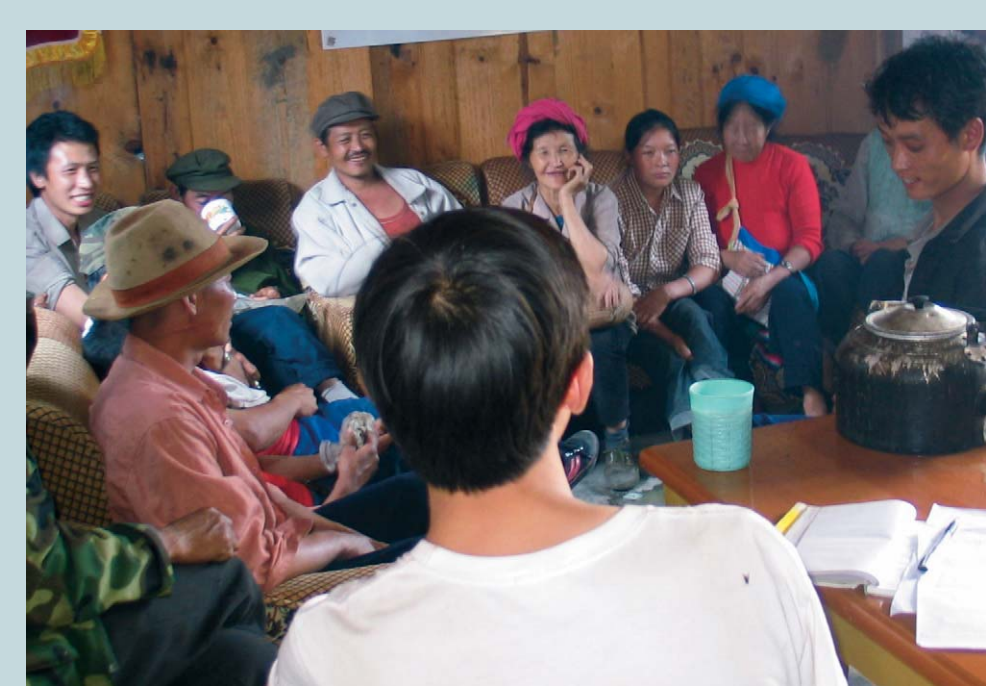
FIGURE 4 Project staff discussing establishment of a revolving drug fund with villagers.

In this process, we have been encouraging both community members and extension workers to pay attention to the potential of local knowledge. For example, villagers in Bahang hamlet were almost unanimous that winter fodder shortage was a major problem affecting cattle health and milk yields. A group began to experiment with exotic fodder grass species. Although the grasses grew well, several of the farmers rejected them. They explained that cattle health depends on maintaining 'vital energy,' and that although the grasses were good, they were not as restorative of 'vital ener-