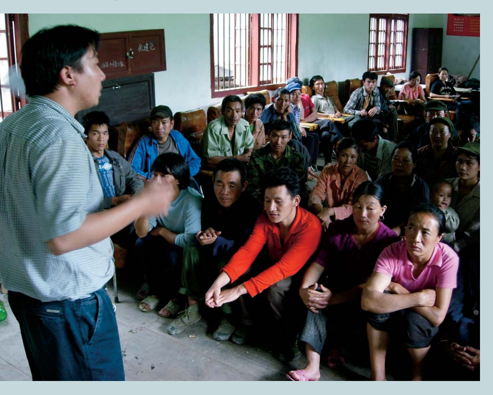
FIGURE 2 Technician explaining the Villager Experiment Groups to assembled villagers.

"I've learned how to chat with the villagers and build relationships with them ..." (A grassroots technician)