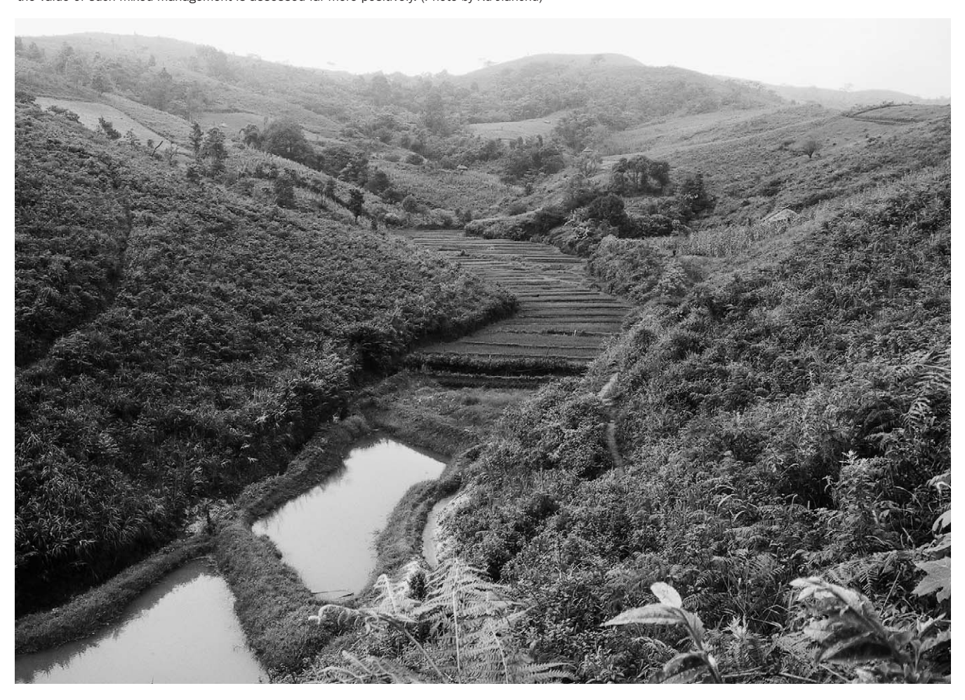
FIGURE 3 Example of the type of land use considered by the government as 'backward,' unproductive, and environmentally detrimental: swidden-fallow landscape with fishponds, paddy, rainfed crops, fruit trees, fallow, etc in Mengsong Hani Adminstrative Village, Menglong Township, Jinghong County, Xishuangbanna. Today, the value of such mixed management is assessed far more positively.

With economic reform in the late 1970s, disillusioned 'educated youths' working in Xishuangbanna initiated what became the 'Return to the Cities' national protest movement. Many state rubber farms nearly collapsed. Some upland Hani villages were persuaded to move to lower altitudes to provide state workers to meet the labor deficit after the departure of the 'educated youths.' In order to make them more efficient