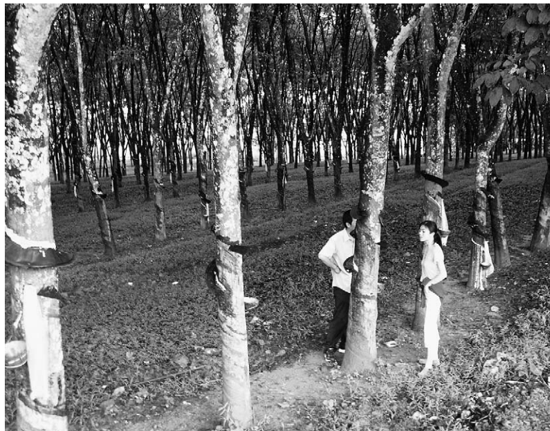
FIGURE 2 A 'legible' and 'legitimate' landscape according to the Maoist perception of nature as an environment to be completely domesticated so that it will serve mankind: rubber plantation in Menglong Township, Jinghong County, Xishuangbanna.

Shifting cultivators in Xishuangbanna such as the Lahu, the Hani and the Jinuo were thought to represent a primitive mode of production. Based on this appraisal, ideologically driven planners concluded that state rubber farms needed to be staffed by people whom they saw as the more 'educated' and 'advanced' peasants, that is, by Han Chinese farmers and 'educated youths' resettled at the 'frontier' of inland China. Those 'advanced' peasants were organized collectively in rubber plantations to become state workers representing forces of production in the socialist model. This reflected a general trend towards managed, 'legible' landscapes (Table 2).