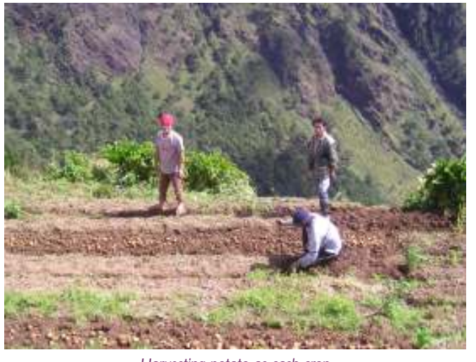
Harvesting potato as cash crop

reveal the environmental functioning in the area so the Bakun people have the knowledge needed to maximize production of environmental services including water