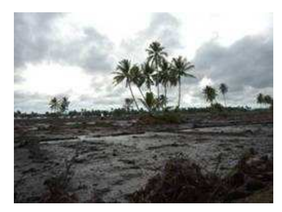
Figure 2. Tsunami damaged coconut in West Aceh