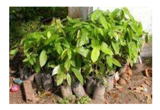
Figure 6. Cocoa seedlings ready for planting in the field.

World Agroforestry Centre (ICRAF) is one of 15 organizations under the CGIAR (Consultative Group on International Agricultural Research) umbrella. ICRAF aims to stimulate and conduct innovative research, development and capacity building to promote and support agroforestry for both human and environmental benefits. ICRAF has its headquarters in Kenya and six regional offices in the tropics and now cover 21 countries in Africa, Asia and Latin America.