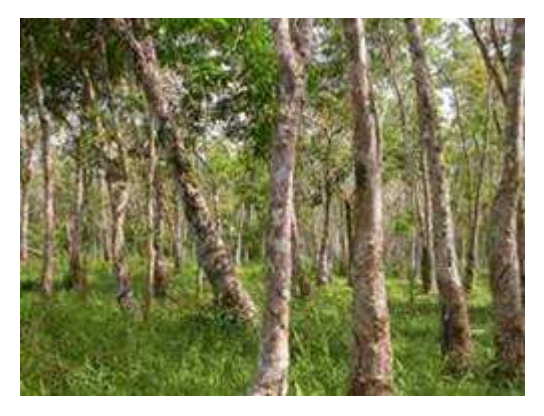
Figure 3. Rubber plantations on peat dome