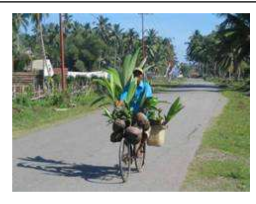
Figure 4. Coconut seedlings for planting after the Tsunami damage