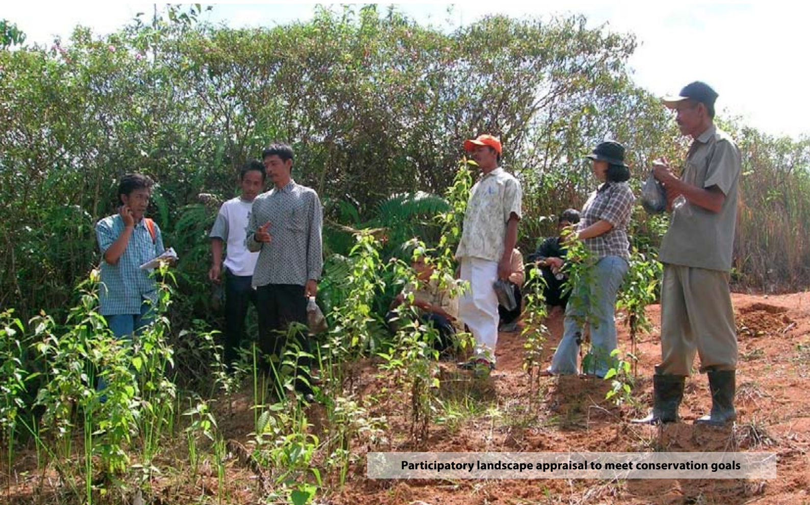
Participatory landscape appraisal to meet conservation goals

In many countries, governments still perceive that forests are the only possible provider of important environmental services, and there are long traditions of 'reforestation' or even 'afforestation' (for lands that have been without forest cover for at least 50 years). Often these programmes start in response to a man-made or natural disaster, such as the Yangtze floods in 1998 in China. However, such programmes do not lead to natural forest conditions, but emphasize the growing at high-planting density of fast-growing trees, often of only one or a few species. The programmes typically suffer from top-down planning, administrative issues, and low on-the-ground success rates against the conservation objectives set. But more fundamentally, these programmes may not have been realistic to start with.