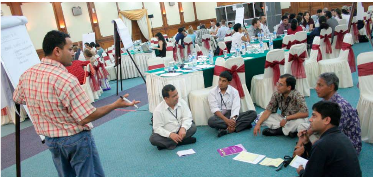
RUPES Global Event as a medium for stakeholder’s interactions at local, national and international level