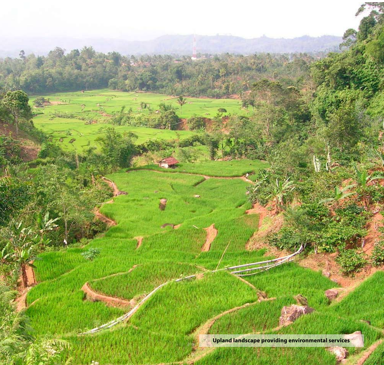
Upland landscape providing environmental services

The RUPES project identified and started to address constraints inhibiting systematic transfers of rewards to upland communities. These constraints include a lack of political will or institutional capacity, lack of a supportive legal framework and financial resources, and even limited community interest and commitment. Institutional constraints are examined, such as conflicting and competing jurisdiction by multiple government agencies (e.g. Ministries of Environment and Ministries of Forestry) over the regulation of upland environment services provided by the people living there. RUPES recognized these constraints and attempted to provide solutions through its experiences in facilitating independent national ES networks in Indonesia and the Philippines. RUPES involvement at national level – especially in these two countries – offered a promising approach to improving coordination between government agencies and improving existing legislation on environmental conservation.