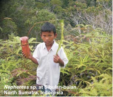
Nephentes sp. at Sibulan-bulan, North Sumatra, Indonesia

reserves. Fortunately, jungle rubber system is still commonly practiced in Bungo. Earlier research in Bungo indicates the 'jungle rubber' agroforests are becoming increasingly important as a reservoir of forest diversity and now provide some of the forest 'services' valued in natural forests. As the financial gains from monoculture plantations are much higher than from jungle rubber, land conversion to monocultures is taking place rapidly. A new approach of providing rewards for environmental service of (agro)-biodiversity conservation in rubber agroforest system was proposed as an alternative means by which the opportunity costs from alternative land uses can be off-set. Hence, RABA was developed and tested in the area with summary findings as below: