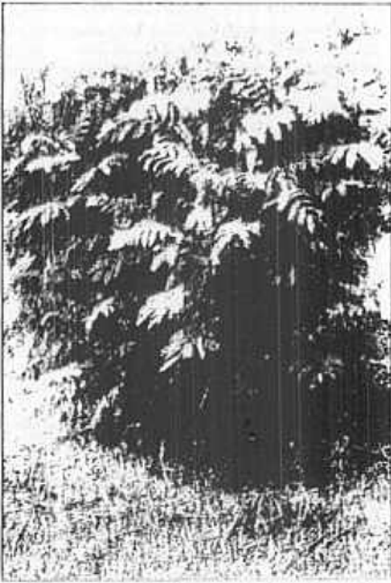
A hedgerow of Peltophorum pterocarpum after five years of pruning and intercropping: a small but dense tree canopy and a thick layer of mulch on the ground

cleared only narrow lines of vegetation in which the tree seedlings were planted. As planting stock, we collected Peltophorum seedlings from secondary vegetation in the area, transferred them to polythene tubes and maintained them until planting time.