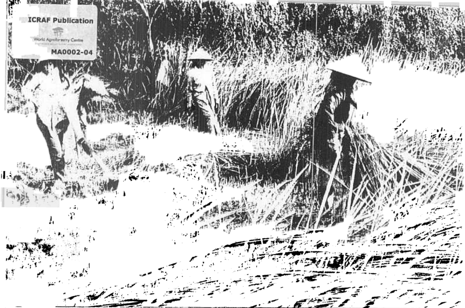
Manual reclamation of land infested with Imperata cylindrica is hard work.