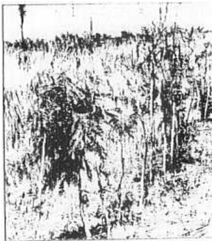
Experiment to establish Peltophorum pterocarpum seedlings in a narrow strip cleared of Imperata cylindrica .

Imperata in the months before the trees are pruned. We hope to know soon.