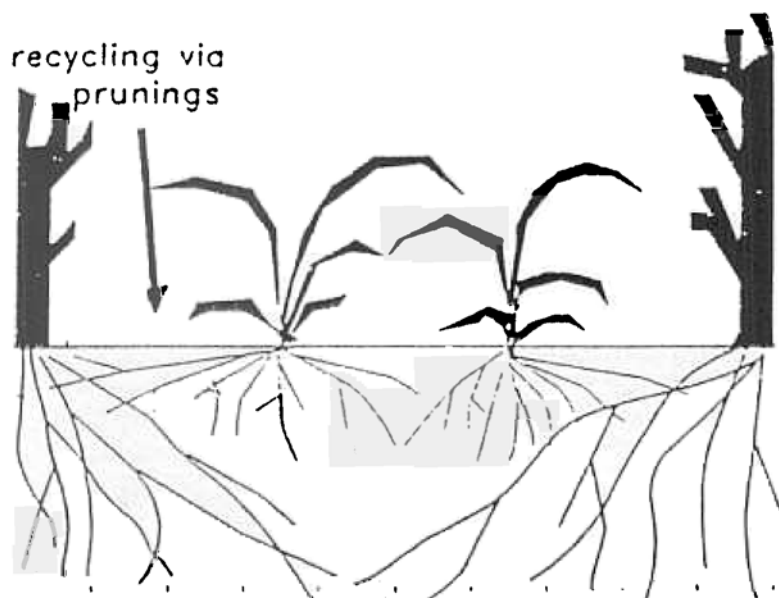
Figure 2.2. Tree roots as a "safety net" for leaching nutrients

Hedgerow intercropping is a specific form of agroforestry, the integration of trees, crops and/or animals in a farming system. The role of the trees in this system is on the one hand to produce directly useful products (firewood, fodder, fruits, nectar for honeybees, etc.) and on the other hand to maintain soil fertility. The number of management options in agroforestry systems is so large and the time needed to perform an experiment so long (several years at least), that a direct trial-and-error approach is not efficient. Research is probably more successful when it is part of a "diagnosis and design" process. The interaction between trees and crops can be negative as well as positive and to guide proper choices we should know the bottlenecks for a given situa-