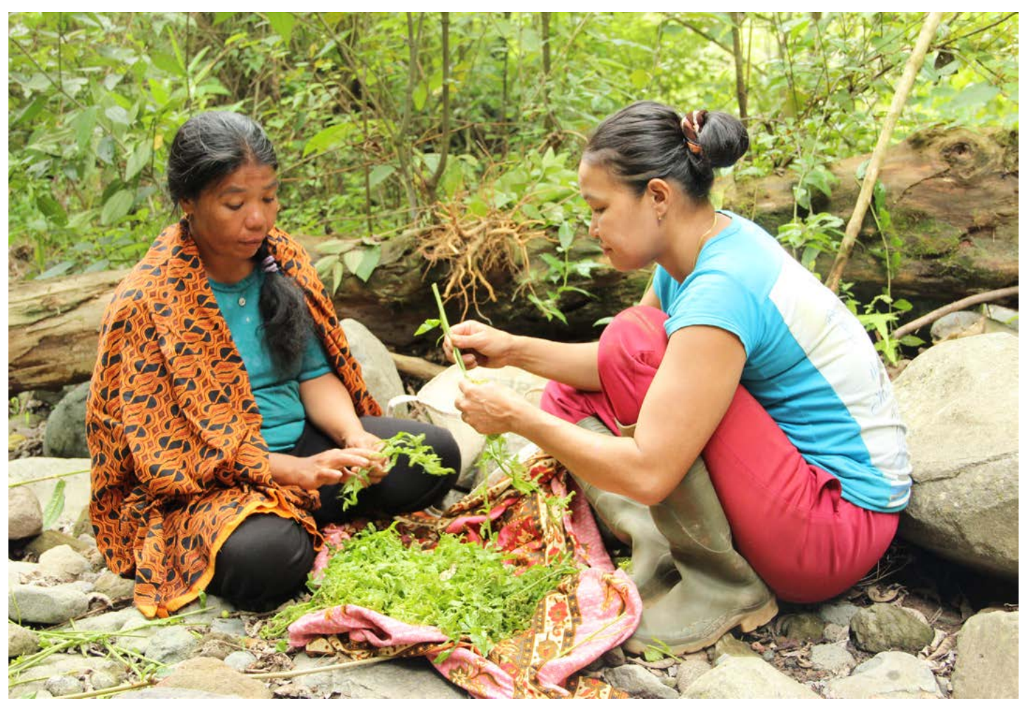
Women with ferns collected from the village forest.

proposal from the district head, mayor or governor has been submitted (Partnership for Governance Reform 2011, Santosa and Silalahi 2011)). In reality, in most cases the land designation is not according to procedure, with a lack of accurate geographical data often leading to mistakes in location.