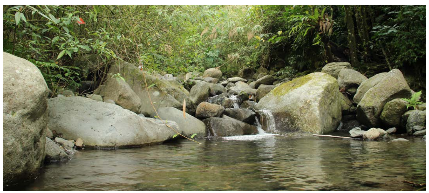
Sangka Timur River in Bonto Tappalang village forest (part of Labbo village forest), a potential water source for micro-hydropower.

The procedure for establishing HD is more a bureaucratic than an empowerment process. The focus is on administrative procedures, which are complicated and costly both in time and money. According to the regulations, the determination of the HD working area should be finalized within 90 working days after the