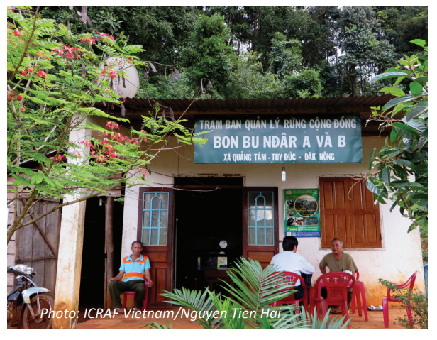
A Community Forest Management board in Quang Tam commune, Tuy Duc district, Dak Nong province

But a comprehensive policy on CFM is still missing. CFM-related policies are mentioned separately as one chapter or article of cumbersome legal regulations, which are often difficult to follow.