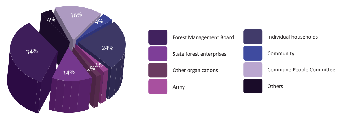
Figure 2: Forests allocated to different entities