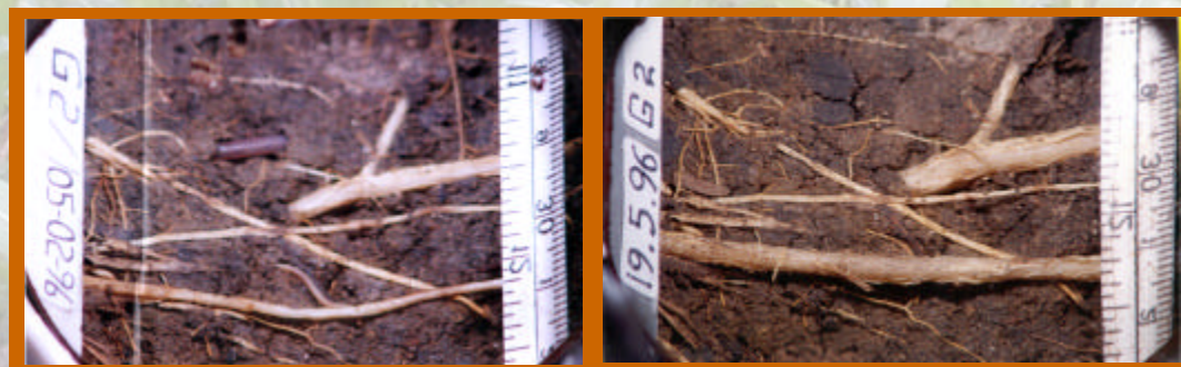
Root growth of Gliricidia at different time of observations