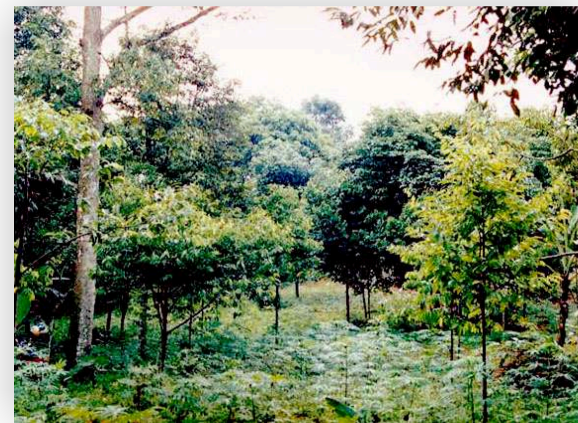
Figure 2. Pekarangan system