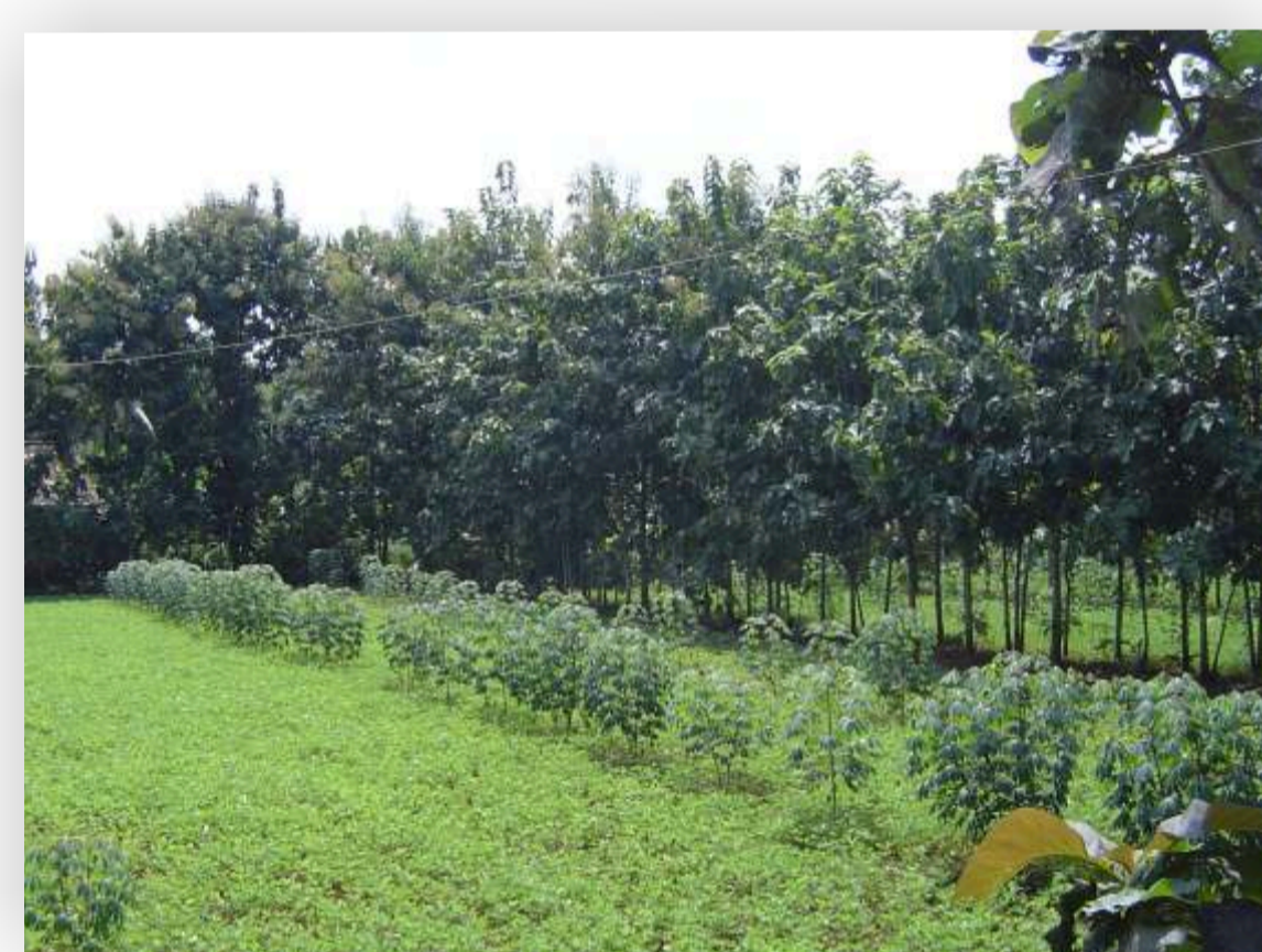
Figure 4. Border planting system