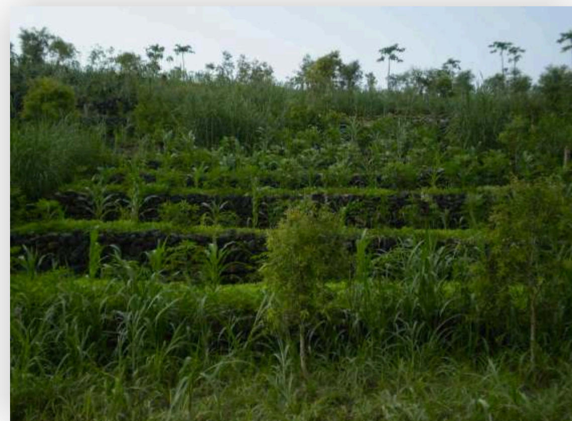
Figure 1. Tegalan system