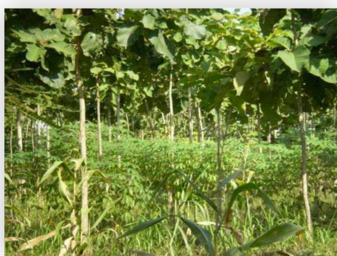
Figure 3. Kitren system